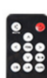
Remote controller & touch pen