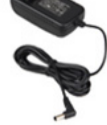
Home power adapter