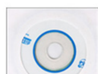
Touch driver disc