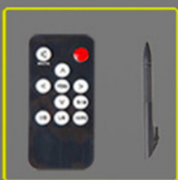
Remote Controller & Touch Pen