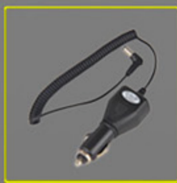
Car Power Cord