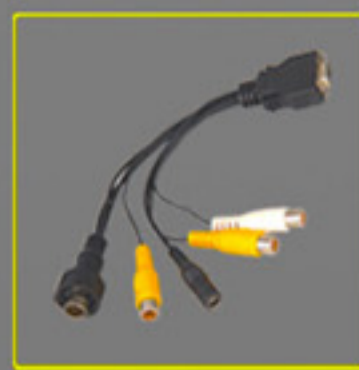
14 PIN SKS Cord