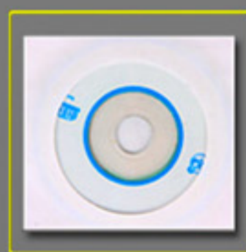
Touch Driver Disc