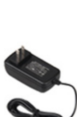
Home Power Adapter