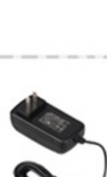
Home power adapter