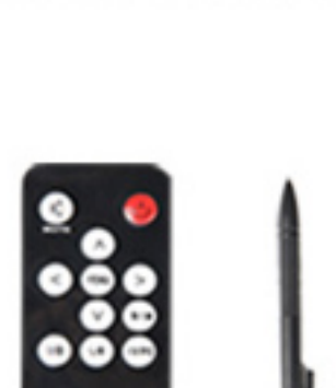
Remote controller & touch pen