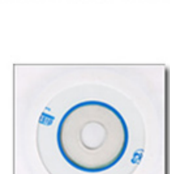
Touch driver disc