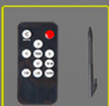
Remote Controller & Touch Pen