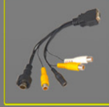
14 PIN SKS Cord