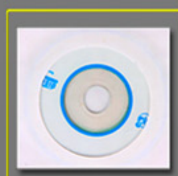
Touch Driver Disc