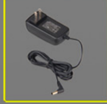
Home Power Adapter