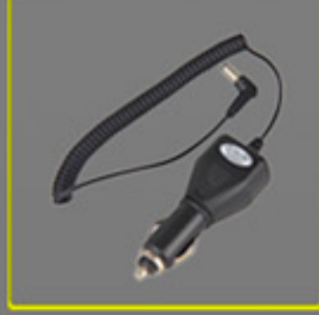
Car Power Cord